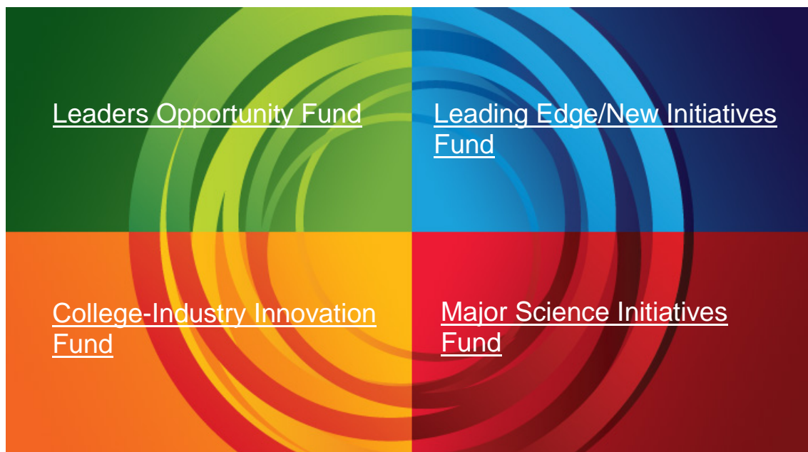
Figure 2.1 – Core programs

The complete descriptions of core programs, strategic partnerships and other programs are available in the “Our funds” section of the CFI website ( www.innovation.ca/en/OurFunds ).