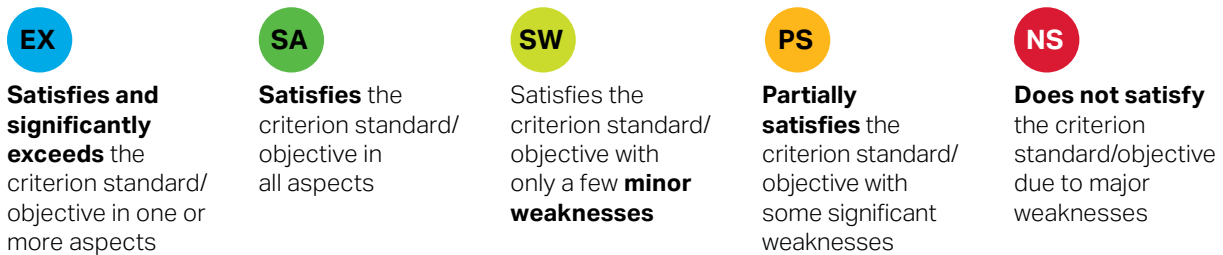
Figure 2: Rating scale

We use a five-point rating scale with statements about the degree to which a proposal meets each criterion standard or competition objective.