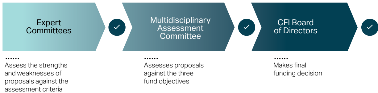
Figure 1: The College Fund merit-review process

We believe that nurturing an equitable, diverse and inclusive culture is the responsibility of every member of the research ecosystem, including funders, institutions, researchers, experts and reviewers.