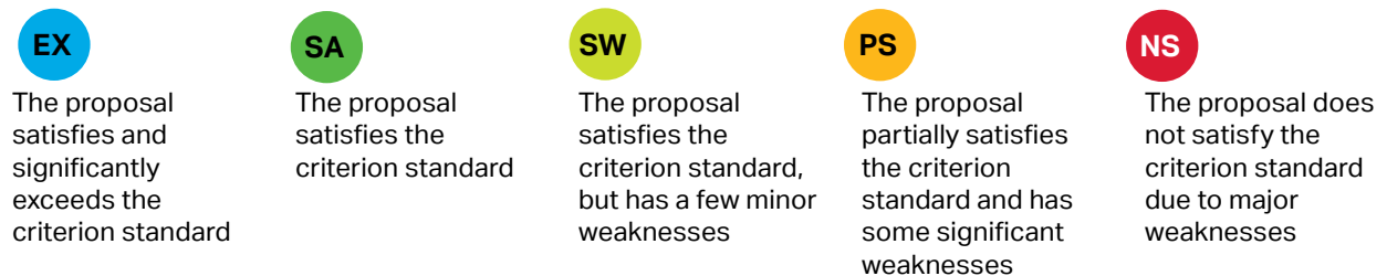
Figure 2: Rating scale

We use a five-point rating scale with statements about the degree to which a proposal meets each criterion standard (Figure 2). Your rating must be supported by the proposal's strengths and weaknesses based on the criterion standard. We encourage you to use the full range of ratings to assess proposals, both in your preliminary assessment and when the Expert Committee reaches a consensus on the ratings.